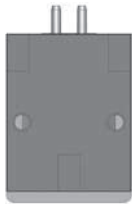
Cartridge front view